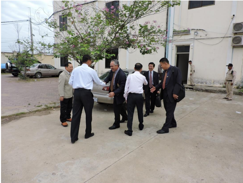
Arrival of EAHC delegation to Inlands Waterways and Transport Department

Phnom Penh, 5 Apr - The National Hydrographic Centre (NHC) of Malaysia has led the East Asia Hydrographic Commission (EAHC) Technical Visit delegation to Phnom Penh from 3 - 5 Apr 17. The objectives of the visit is to enhance technical cooperation in the region and to encourage non-Member States to join the International Hydrographic Organisation (IHO) and EAHC.