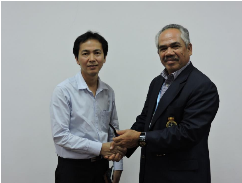
Exchange of momento between EAHC Chairman and PPAP Deputy Director