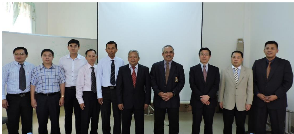
EAHC and Cambodian Delegation