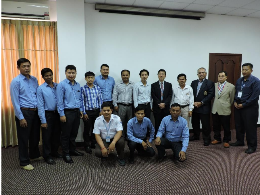
EAHC delegation with Phnom Penh Autonomous Port Management