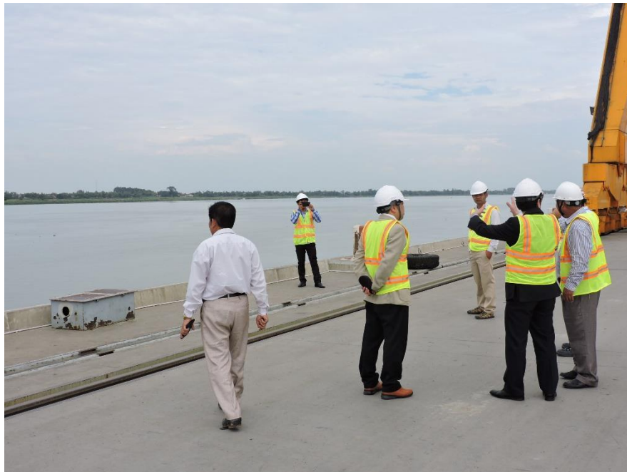
Visit to PPAP wharf

On 5 th Apr, the delegation met Secretary of State of Public Works and Transport for a courtesy call and to brief His Excellency the outcomes of the technical visit. His Excellency expressed his appreciation to the delegation and welcome the initiatives and recommendation of the EAHC delegation. He agreed for Cambodia to join IHO membership and will seek the higher authority approval. He requested the delegation to provide more information especially on the benefits and advantages for being a member of the organisation for his further action. Generally the technical visit was very fruitful and rewarding.