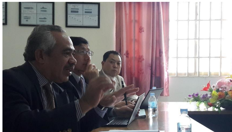
EAHC Chairman explained the role of EAHC

The discussion covers on introduction, set up and role of the IHO and EAHC, however it was focus more on benefits and advantages of being member of the two organisations especially on capacity building in hydrographic surveying and charting professionalism. The Cambodian government was informed that the capacity building assistance could only be extended if Cambodia become member of the organisation. The Cambodian delegation acknowledged the important and benefits of being part of IHO members and request the EAHC delegation to help and provide with more information to assist them in pursuing the matter to the higher authority. The discussion was concluded with very fruitful and encouraging outcomes.