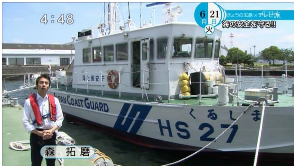
TV reporter and Survey Vessel “Kurushima” belonging to 6 th Regional Headquarters

In order to make World Hydrography Day widely known in Japan, a press release was conducted in Tokyo on 10th June, in which World Hydrography Day was explained including its history. At the 6th Regional Coast Guard Headquarters (Hiroshima), the press media were invited aboard a survey vessel and learned the outline of hydrographic service.