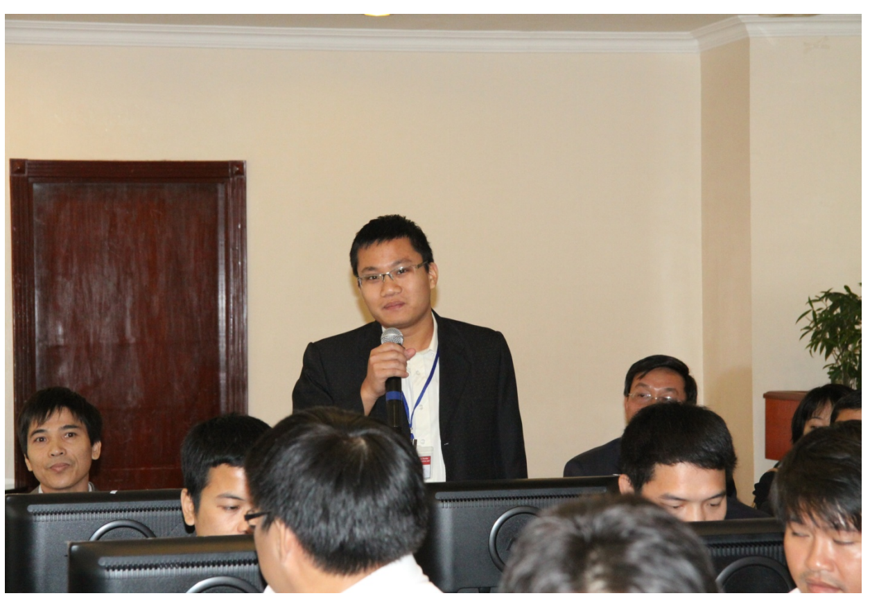
Practice and discussion

On day 2, a focus was given on hands-on practice on carrying out QA and corrective action using Seven Cs ENC software. The participants learned the difference between warnings and errors, and where important errors occur during ENC production and how to fix them. Participants also shared their experiences and techniques to fix errors.