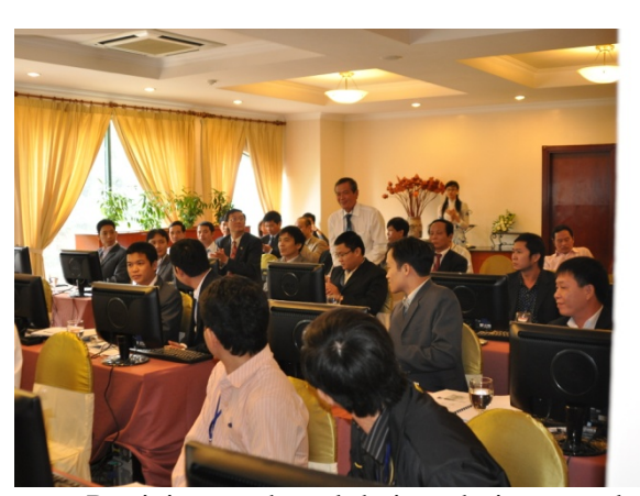
Participants shared their techniques and experiences