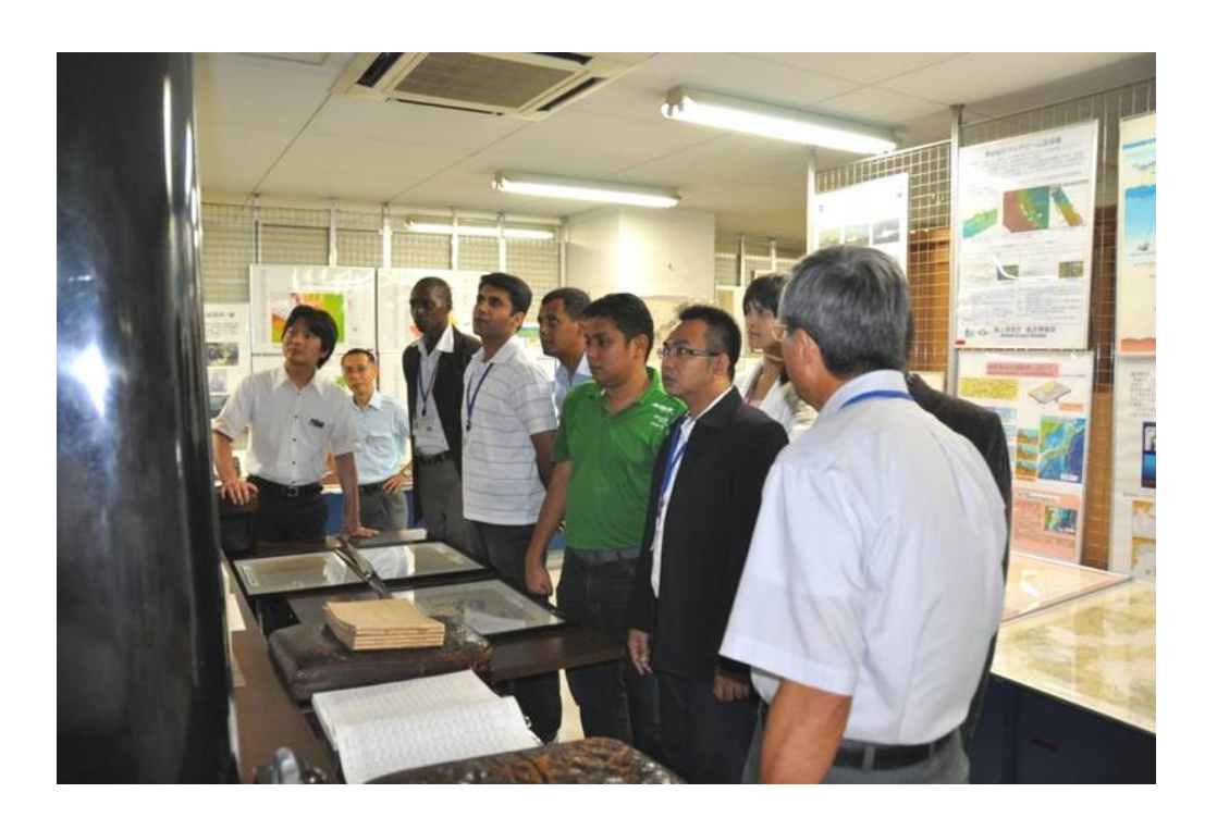
Reported by JHOD, Japan

JHOD opened the Hydrographic and Oceanographic Museum to the public from 21st to 23rd June, where IHO publications, poster and slideshow describing the IHO, "Ino-Zu (Japanese historical maps)", and old Military Charts, etc. were on display.