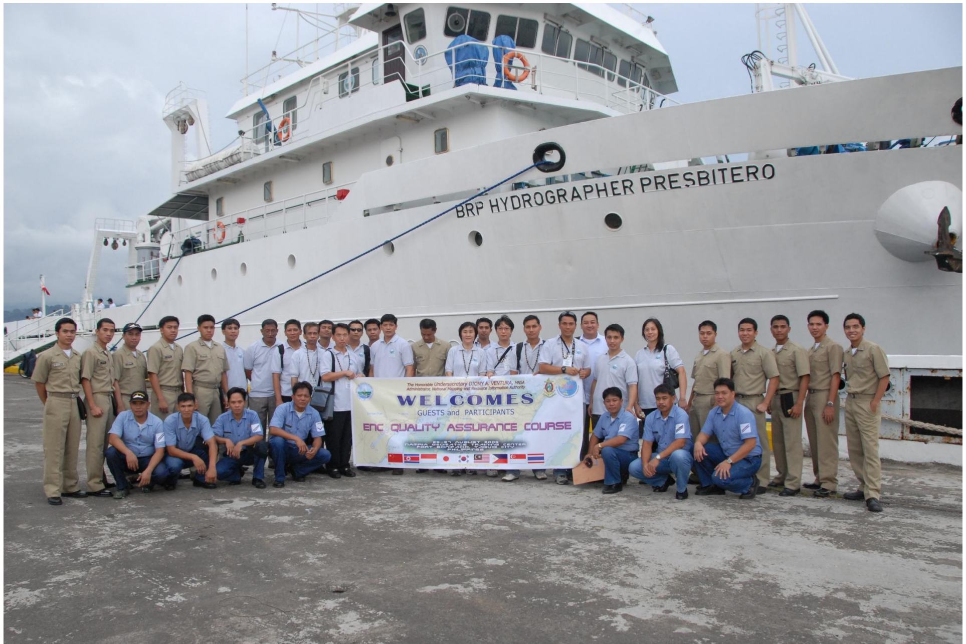
ENC QUALITY ASSURANCE COURSE PARTICIPANTS TOGETHER WITH OFFICERS AND CREW OF BRP HYDROGRAPHER PRESBITERO