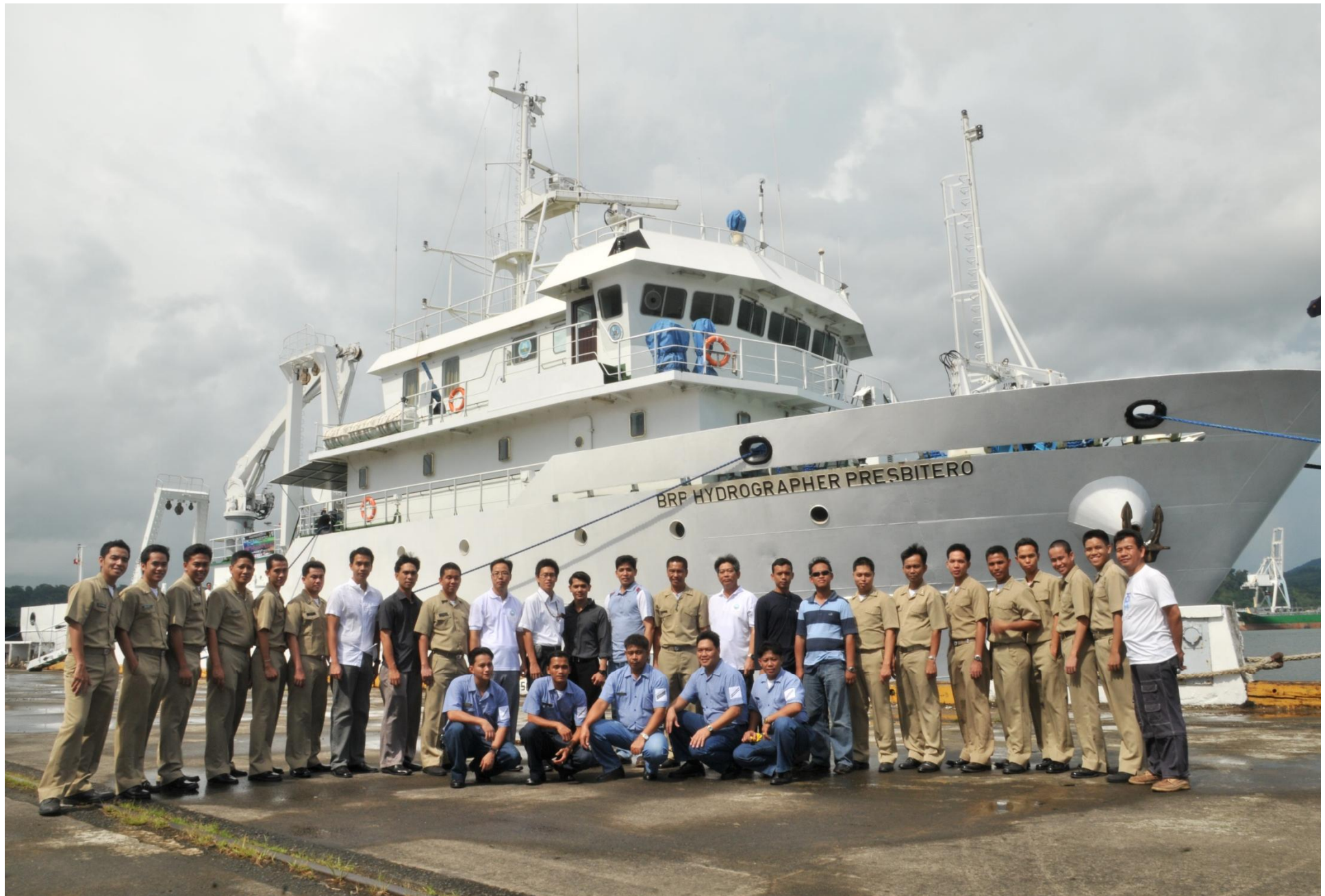
MULTIBEAM SURVEYING COURSE PARTICIPANTS TOGETHER WITH OFFICERS AND CREW OF BRP HYDROGRAPHER PRESBITERO