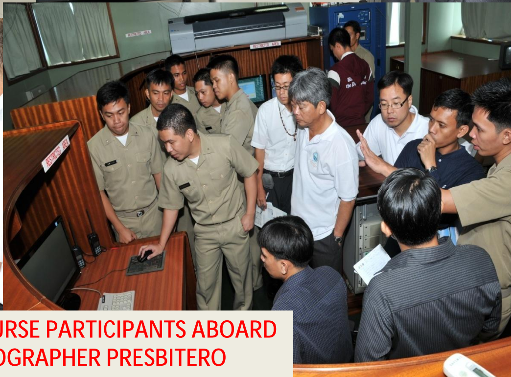
MULTIBEAM COURSE PARTICIPANTS ABOARD BRP HYDROGRAPHER PRESBITERO