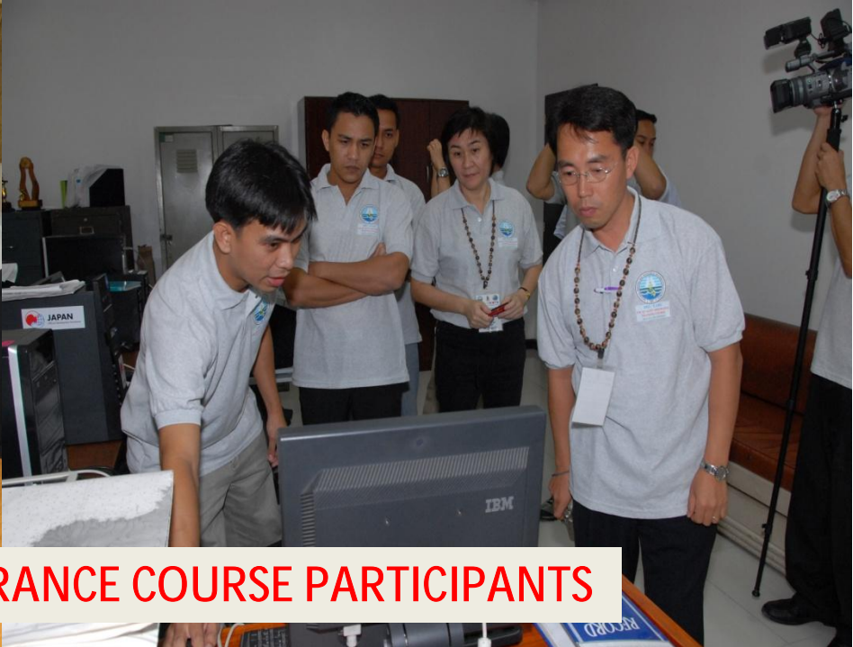
ENC QUALITY ASSURANCE COURSE PARTICIPANTS