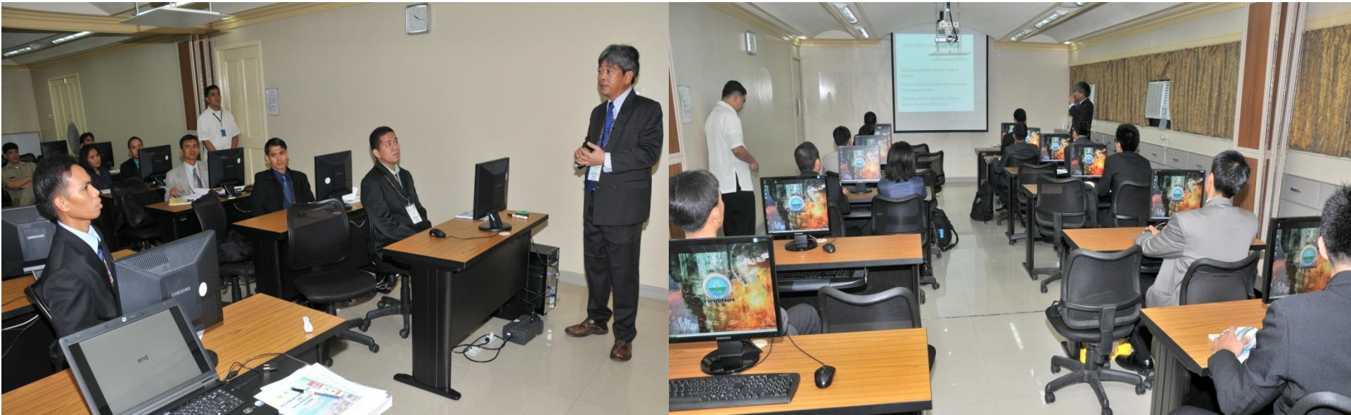
MULTIBEAM COURSE PARTICIPANTS AT THE TRAINING ROOM