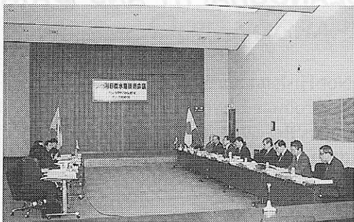
The meeting held at Conference Hall of JHD

Close discussions and exchange of information were made on the common topics of both organizations. At the final stage of the meeting it was agreed that the next meeting would be held in Korea in 2001 and the dispatch of survey vessel "SHOYO" will be expected. The meeting was closed in a friendly atmosphere.