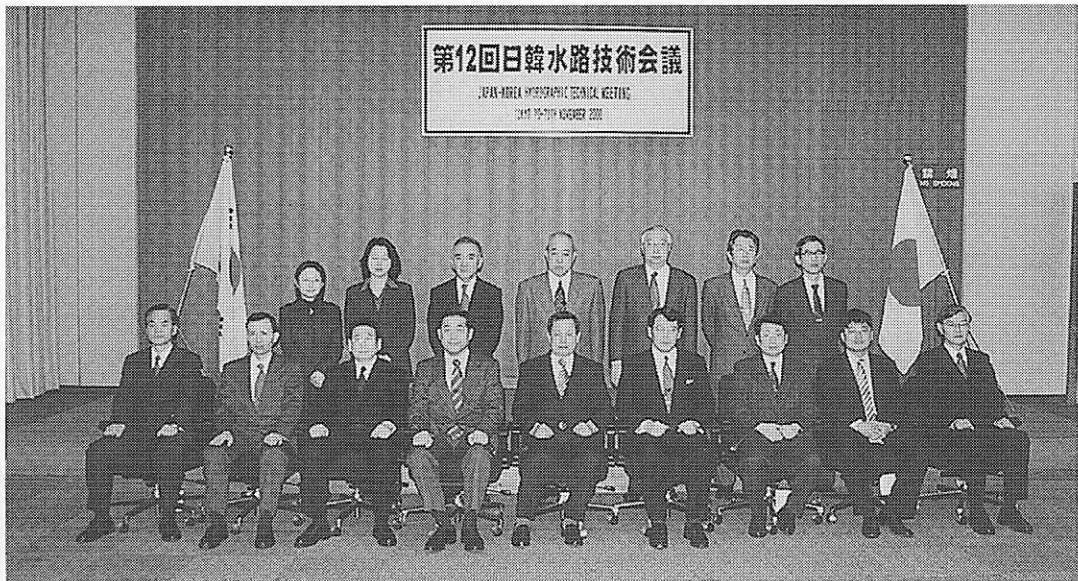
Participants in the Meeting

12th Japan/Korea Hydrographic Technical Meeting was held at the Hydrographic Department of Japan (JHD) in Tokyo on 20-22 November 2000. The Meeting was organized by JHD.