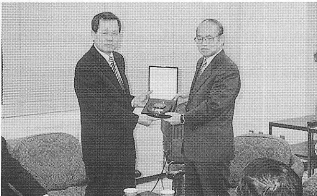
Courtesy call on Chief Hydrographer of Japan