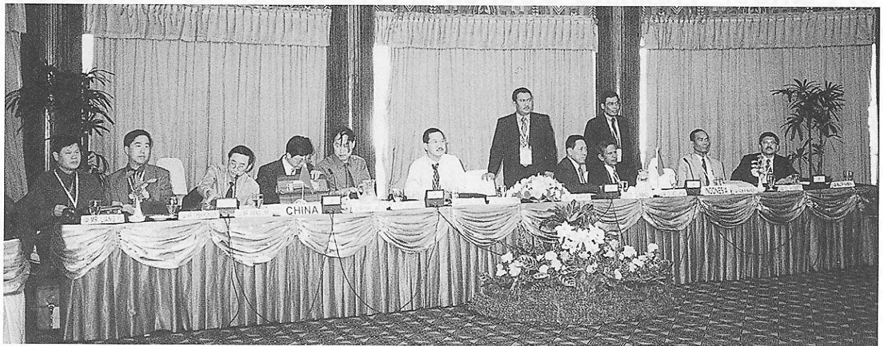
Conference Hall at the Horison Hotel

The subjects discussed at the Conference were as follows: