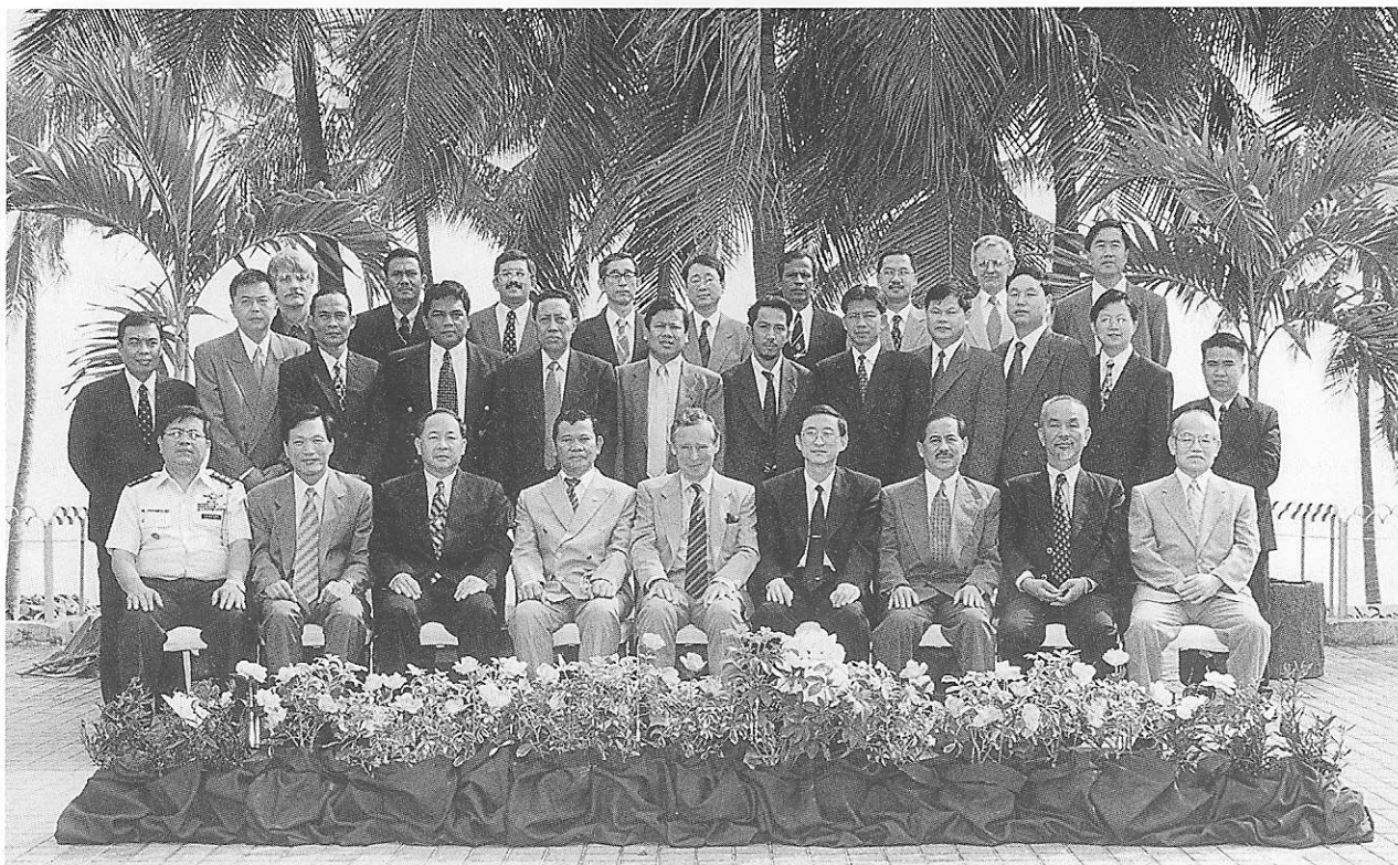
PARTICIPANTS OF 7TH EAHC CONFERENCE

Pursuant to decision made during the 6th East Asia Hydrographic Commission(EAHC) Conference at Kuala Lumpur in 1995, the 7th EAHC Conference was held at the Horison Hotel in Jakarta from 4 to 7 July 2000.