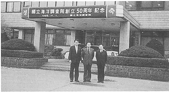
Japanese delegation in front of NORI

The following items were informed and discussed at the meeting.