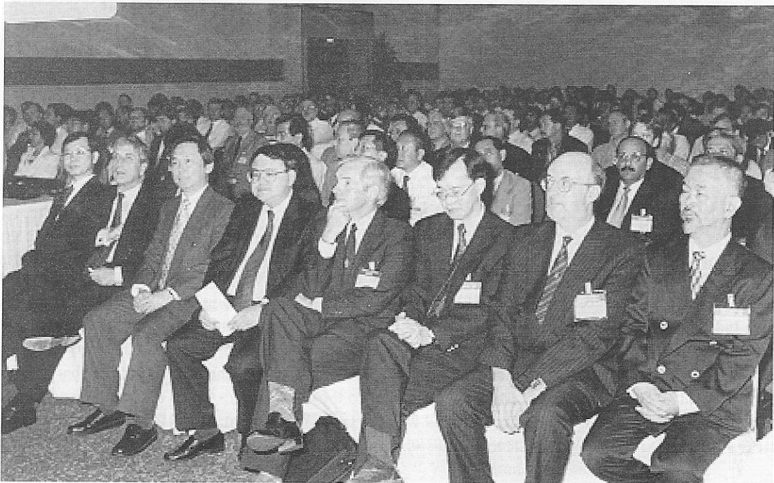
Conference hall in the Pan Pacific Hotel, Singapore

The Conference theme was "ECDIS - An Effective tool for Safe Navigation" and the sessions included "ECDIS - An Efficient Tool For Navigational Safety, Official World Wide Digital Data For Global Shipping, Maritime Digital Chart Data Business, ECDIS For Future Applications, Structured ECDIS Training and Use Of ECDIS For Environmental Monitoring and Protection". The participants felt that the ECDIS Conference was the most comprehensive and informative event held on ECDIS so far.