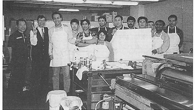
Practice at Printing Section