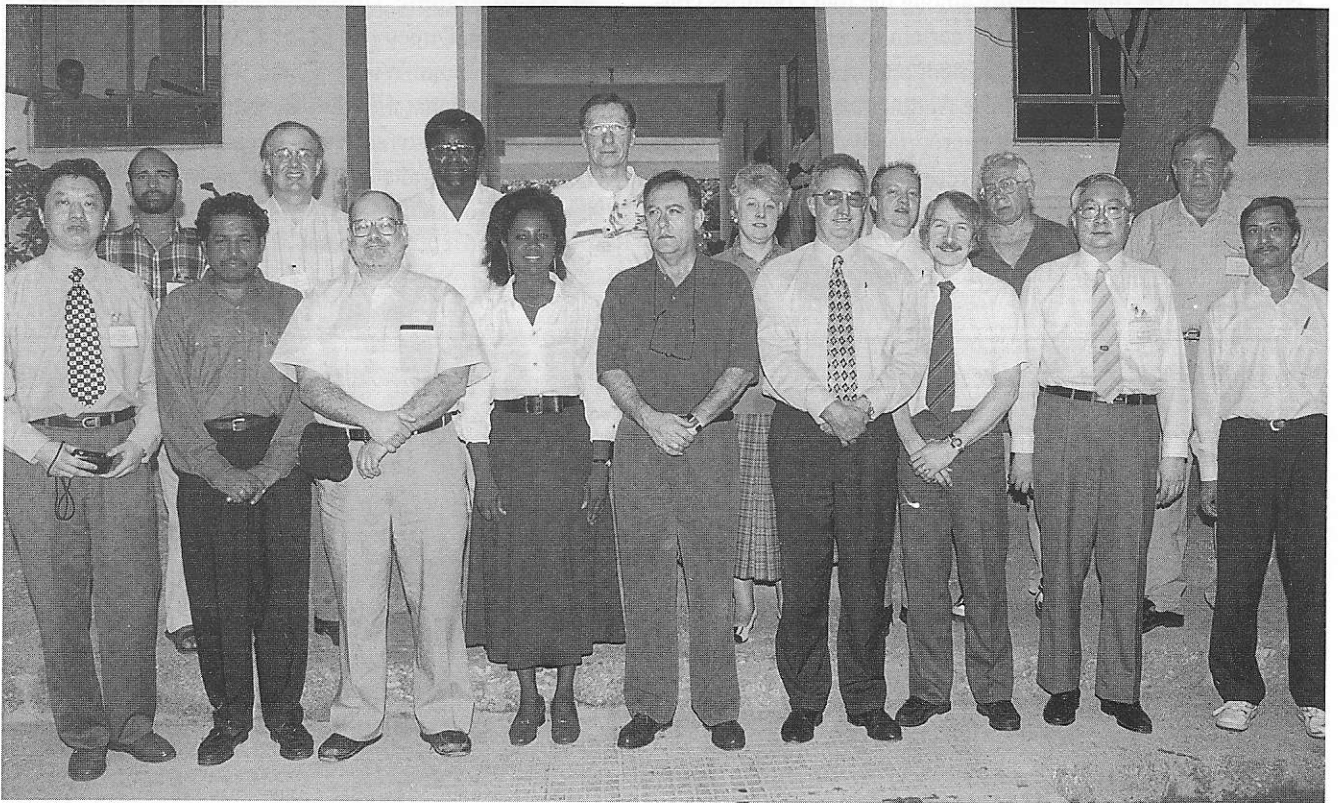
Participants of IOC/IODE Officers Meeting held at Indian National Oceanographic Data Center, Goa, 10 - 13 February 1998

Director of Japan Oceanographic Data Center (JODC), as the regional co-ordinator for WESTPAC.