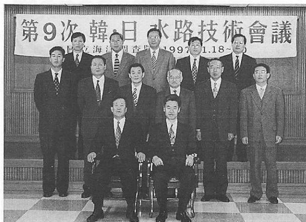
Participants in the Meeting