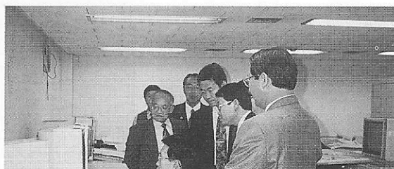
Explanation and demonstration of ENC in the ENC room of NORI

At the final stage of the meeting it was agreed that the next meeting would be held in Japan in the fall of next year and the meeting was closed in a friendly atmosphere.