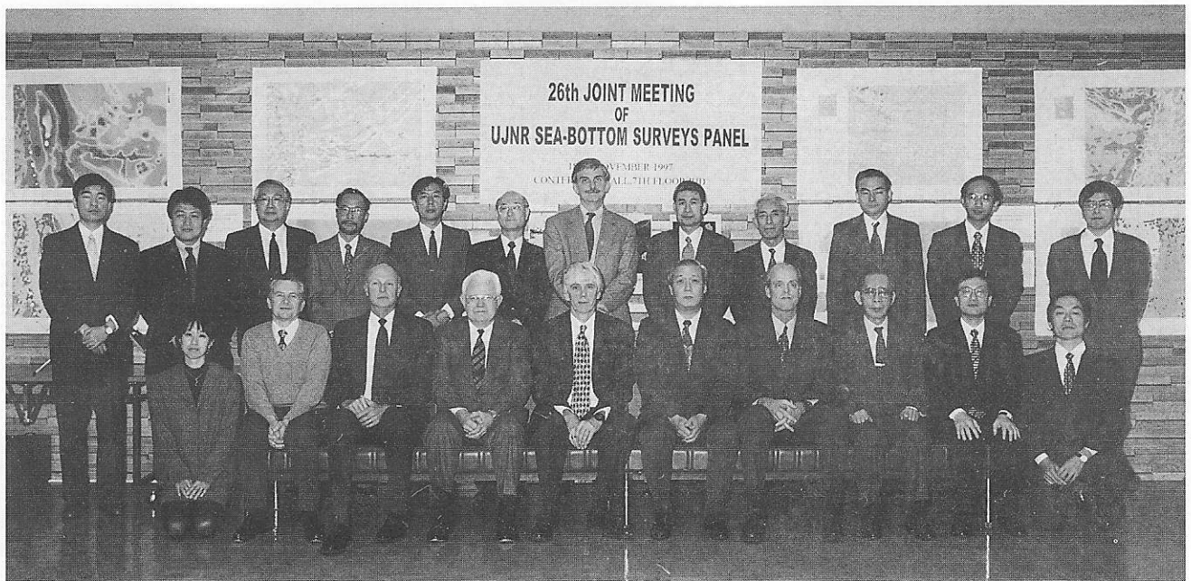
The 26th UJNR Sea-Bottom Surveys Panel meeting held at JHD

The Sea-Bottom Surveys Panel meeting has been held in Japan and the US alternately since its 1st meeting held in Tokyo in October 1972.