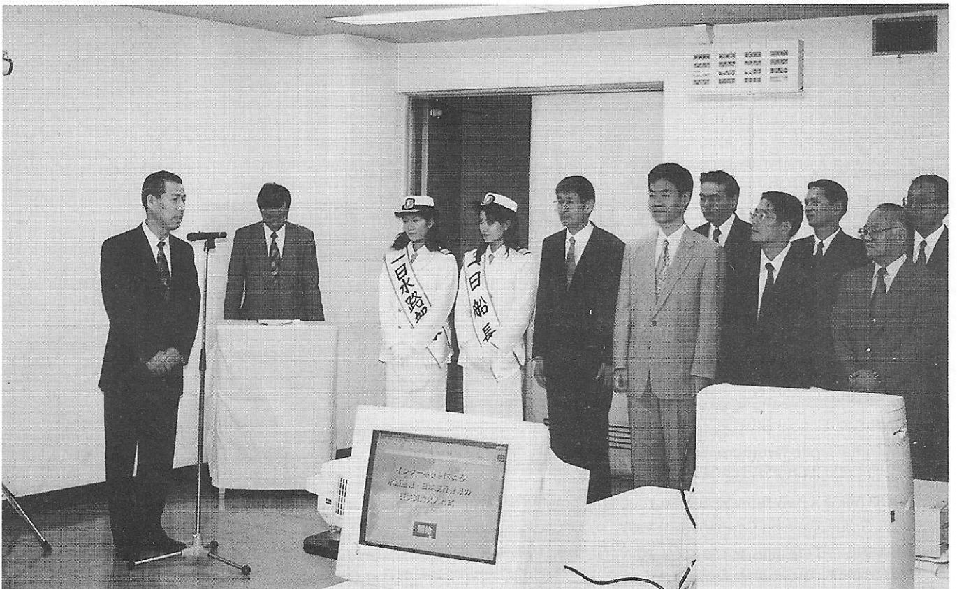
Inauguration ceremony of JHD Internet NtM, attended by the Chief Hydrographer of Japan and his staff