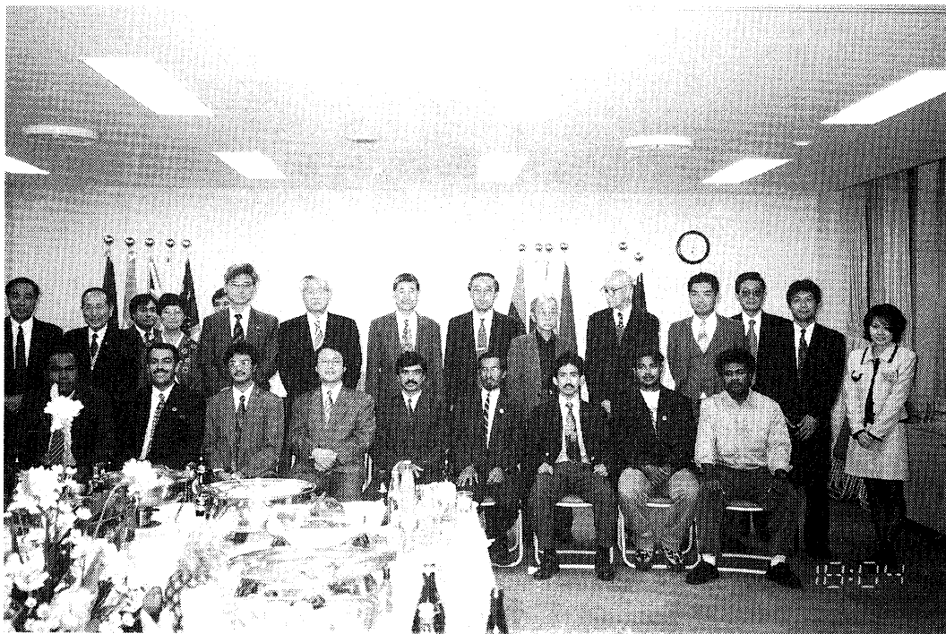
Farewell party took place at Tokyo International Center on 8 December 1996

This Group Training Course has been conducted annually since 1972, attaining its 25th course this year with a total number of 231 participants from 25 countries.