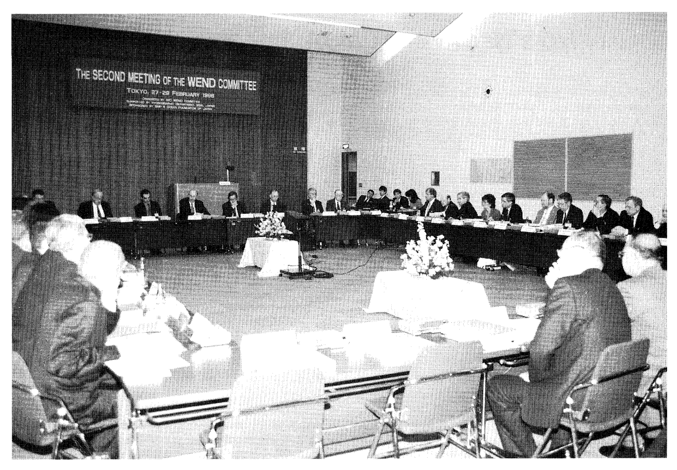
The first day of the 2nd meeting of the WEND Committee, 27 Feb. 1996 Conference Room of JHD, Tokyo