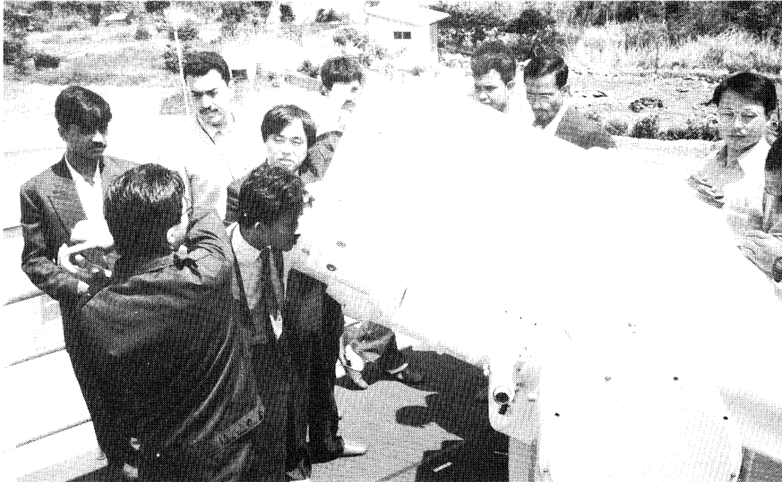
Observation of Satellite Laser Ranging System

The participants observed and were explained about these instruments in the Observatory. They were very interested in these instruments and asked observation officers of the Observatory many questions positively.