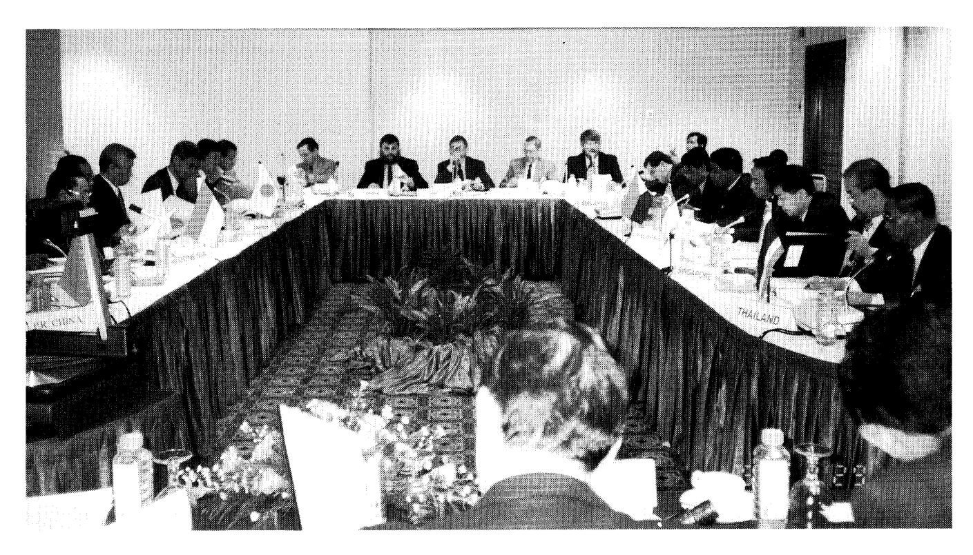
6th EAHC Conference, 28 -31 March 1995