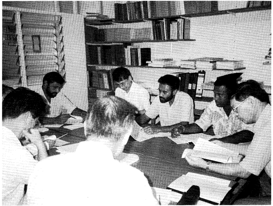
Discussion at Fiji Hydrographic Office

In accordance with P/O, the first hydrographic survey in the northern part of Lau Islands, areas to be covered by Chart No. F52, will be carried out by a joint team of Aero Asahi Corporation and Asia Air Survey Co., Ltd., under the contract with JICA for about three months from early in July 1995, and the compilation of the nautical chart at a scale of 1:150,000, using the