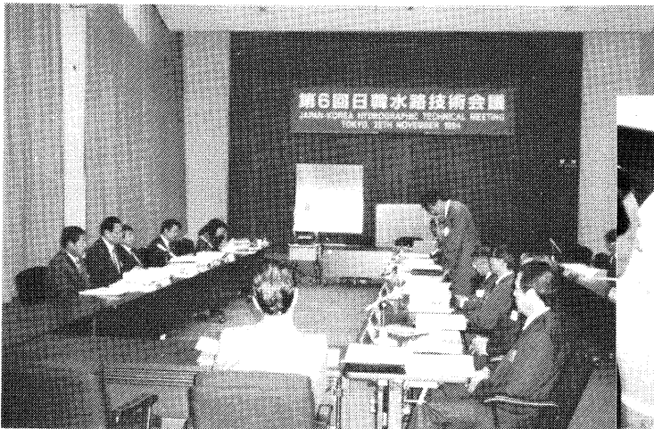
The 6th Japan/Korea Hydrographic Technical Meeting on 22 November 1994