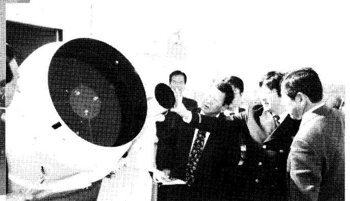
Satellite Laser Ranging System at Simosato Hydrographic Observatory