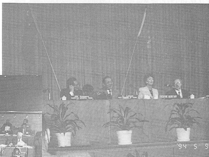
Mr. Li Lanqing, Vice Premier of the P.R. of China making an address at the closing ceremony