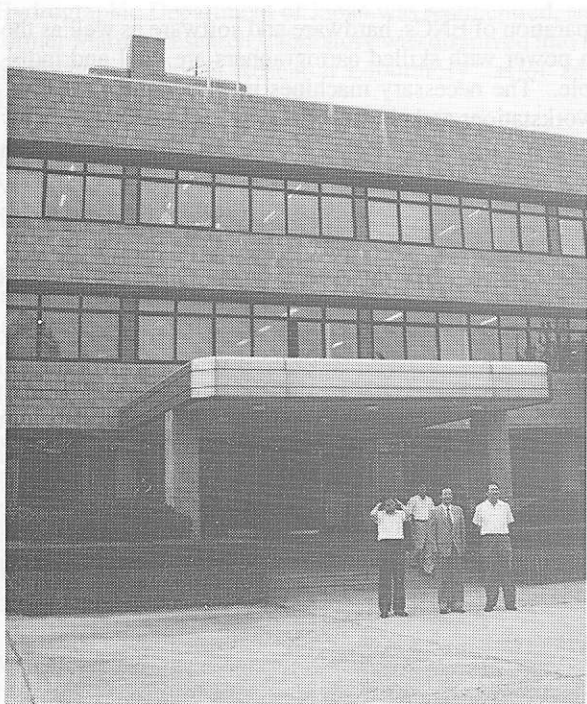
ROKOHA Incheon Headquarters

Japanese and Korean geodetic experts met in Incheon, Republic of Korea, on 14 July 1994, to discuss a cooperative geodetic observation using GPS.