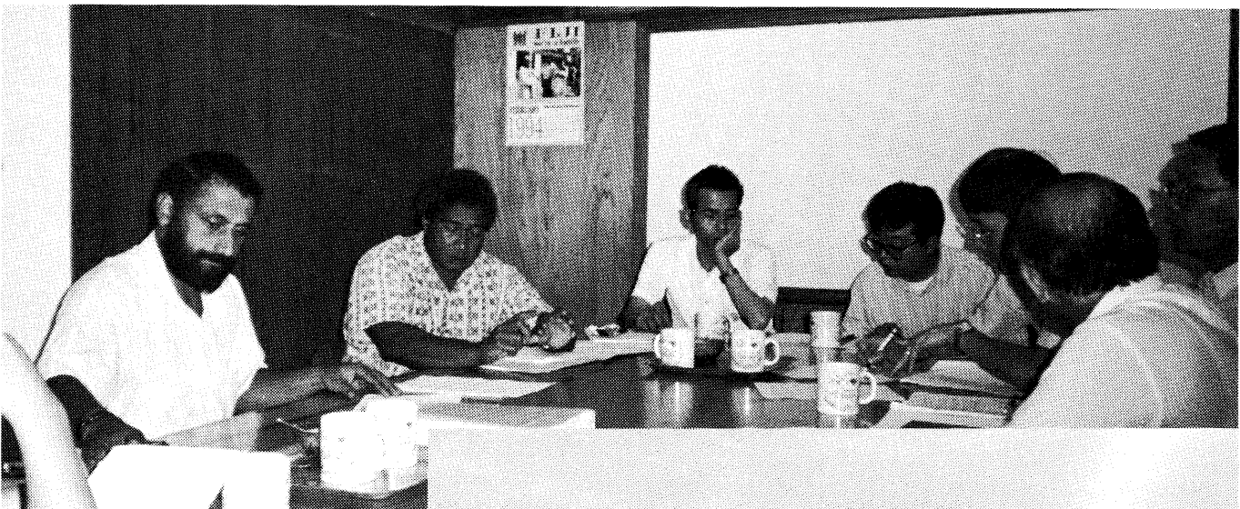
Discussion between Japanese members and Fiji counterparts

In accordance with the agreement, the hydrographic survey will be carried out by using the Survey Vessel TOVUTO (920 G/T) of the Marine Department of Fiji from 1994, and three nautical charts covering the northern part of Lau Islands at a scale of 1/150,000 are to be prepared.