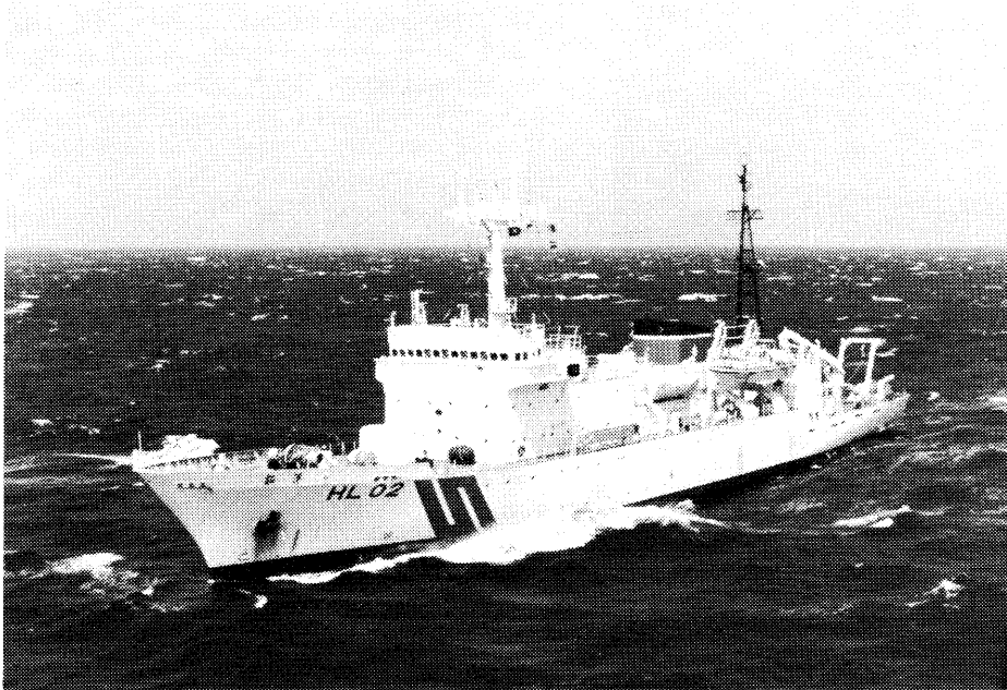
Survey Vessel TAKUYO of J.H.D.

The Survey Vessel TAKUYO (2600 G/T) of the Hydrographic Department of Japan was dispatched to the western Pacific area for carrying out the monitoring of long-term variations in oceanographical structure, as part of the IOC/WESTPAC programme.