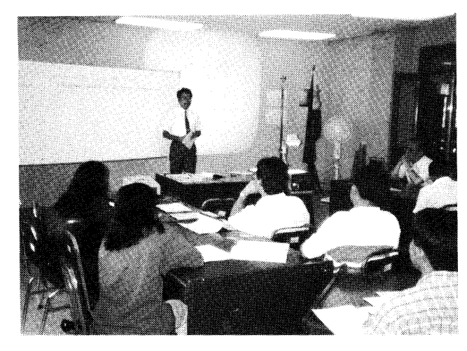
Seminar held in CGSD/NAMRIA in Manila, Philippines 6 October 1992

concerned, who were very much interested in and intent on these subjects focused, and lively discussions and exchange of views were also made fruitfully.