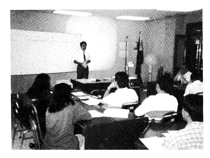
Seminar held in CGSD/NAMRIA in Manila, Philippines 6 October 1992

concerned, who were very much interested in and intent on these subjects focused, and lively discussions and exchange of views were also made fruitfully.